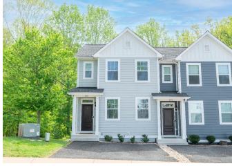
132 Longwood Dr, Charlottesville - For Sale , $459,900