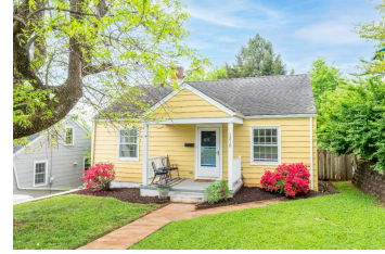
1210 Meriwether St, Charlottesville - For Sale , $450,000