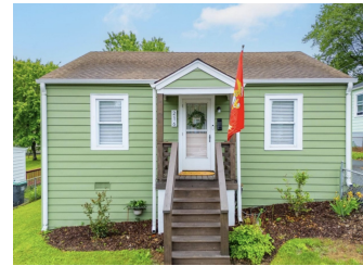
216 Palatine Ave, Charlottesville - Under Contract, $409,000