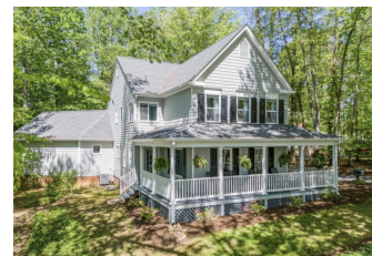
3000 Cove Lane, Charlottesville - Under Contract, $649,000