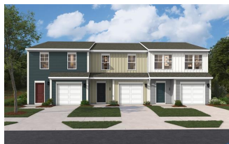
Lot 120 Creekside, Barboursville - Under Contract, $325,000