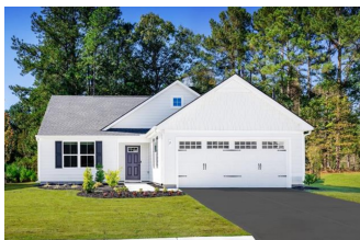
Lot 125 Ivy Commons, Waynesboro - Under Contract, $347,000