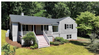
973 Taylors Gap Rd, Charlottesville - Sold, $535,000