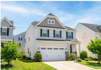
4506 Sunset Dr., Charlottesville - For Sale, $559,900