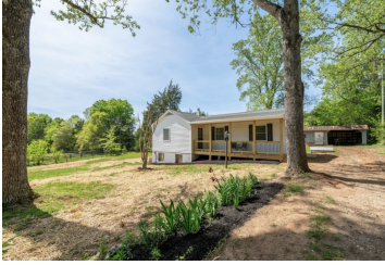
1867 Stage Junction Rd, Columbia - For Sale , $289,000