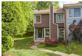
1048 Cheshire Ct, Charlottesville - Under Contract, $295,000