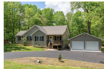
28147 Beech Dr, Rhoadesville - Under Contract, $399,000