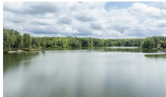
6406 Carter Ln, Mineral - For Sale , $1,975,000